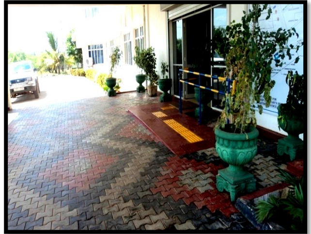
Improvement to Porch CS'S Secretariat