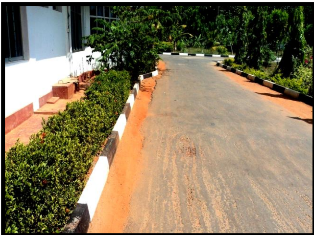
Improvement to Road System