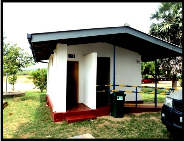
Common Wash Rooms for Public