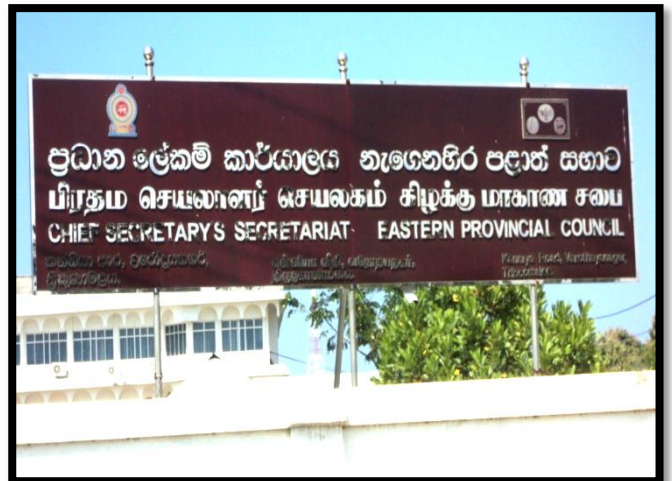
Making and Fixing EPC Name Board